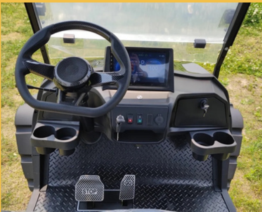
All of our golf carts are equipped with touchscreen displays